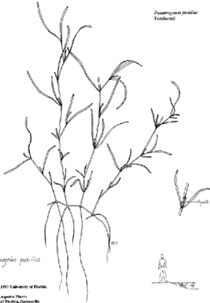
Potamogeton pusillus Fondweed